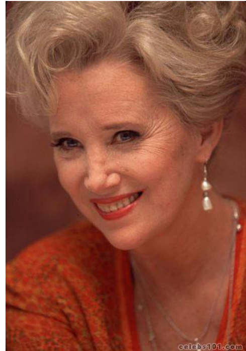
SALLY KIRKLAND OSCAR nominee

Rocky (I-V) (w/ Sylvester Stallone) Once Upon A Time in America (w/ Robert De Niro) New York, I Love You (w/ Natalie Portman) Mickey Blue Eyes (w/ James Caan) Chinatown (w/ Jack Nicholson) Win Win (w/ Paul Giamatti)