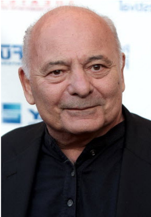
BURT YOUNG OSCAR nominee