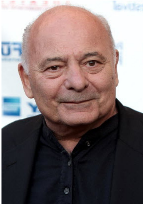
BURT YOUNG OSCAR nominee